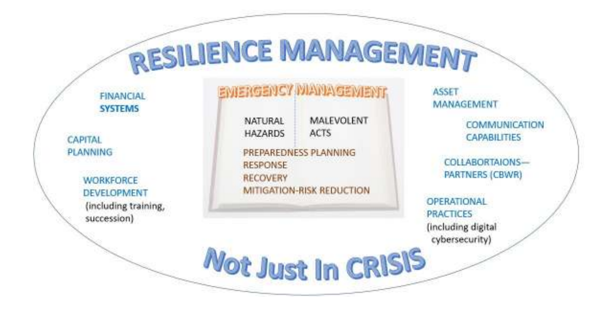
Figure 1: Resilience is Built on Your Total Business Capacities

While it has been conducted with large utilities such as Denver Water, specifically aimed at climate impacts, the guidebook illustrates how resilience must be built around a total approach to business functions for any vulnerability. Our Figure 1 we use in training stresses that crisis and emergency resilience is built on strong ongoing business functions. An especially excellent webinar featuring several projects and practice leaders from the WUCA utility alliance is as of this writing still available from the American Society of Adaptation Professionals (ASAP) at their YouTube Channel: <u>Co-Creation Webinar 8:</u> <u>Designing Utilities of the Future</u> posted November 8, 2021.