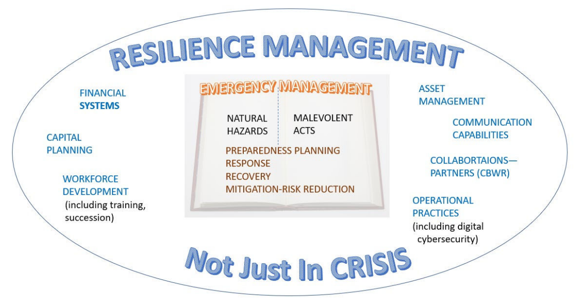
Figure 1: Resilience is Built on Your Total Business Capacities

For a look at broader frameworks in more depth, the Water Utility Climate Alliance (WUCA) and Water Research Foundation jointly have developed a detailed guide and test of approaches in a <u>free report</u>, <u>"An Enhanced Climate-Related Risks and Opportunities Framework and Guidebook for Water Utilities</u> <u>Preparing for a Changing Climate</u>." While it has been conducted with large utilities such as Denver Water, specifically aimed at climate impacts, the guidebook illustrates how resilience must be built around a total approach to business functions for any vulnerability. Figure 1, which the University of Southern Maine uses in our training on resilience, highlights that crisis and emergency resilience is built on strong ongoing business functions. An excellent webinar featuring several projects and practice leaders from the WUCA utility alliance is (as of 2022) still available from the American Society of Adaptation Professionals (ASAP) at their YouTube Channel: <u>Co-Creation Webinar 8: Designing Utilities of</u> <u>the Future</u>.