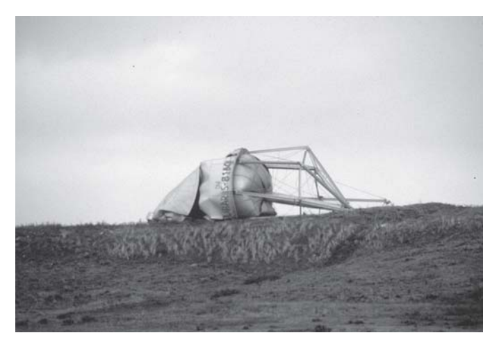
A water tower that has exceeded its useful life!

The worksheets and other information in this guide will also help you begin to develop an overall strategy for your system. Using this guide along with EPA's "Strategic Planning: A Handbook for Small Water Systems" (EPA 816-R-03-015) will help you develop, implement, and receive optimal benefit from an asset management plan that fits in with your system's overall strategy.